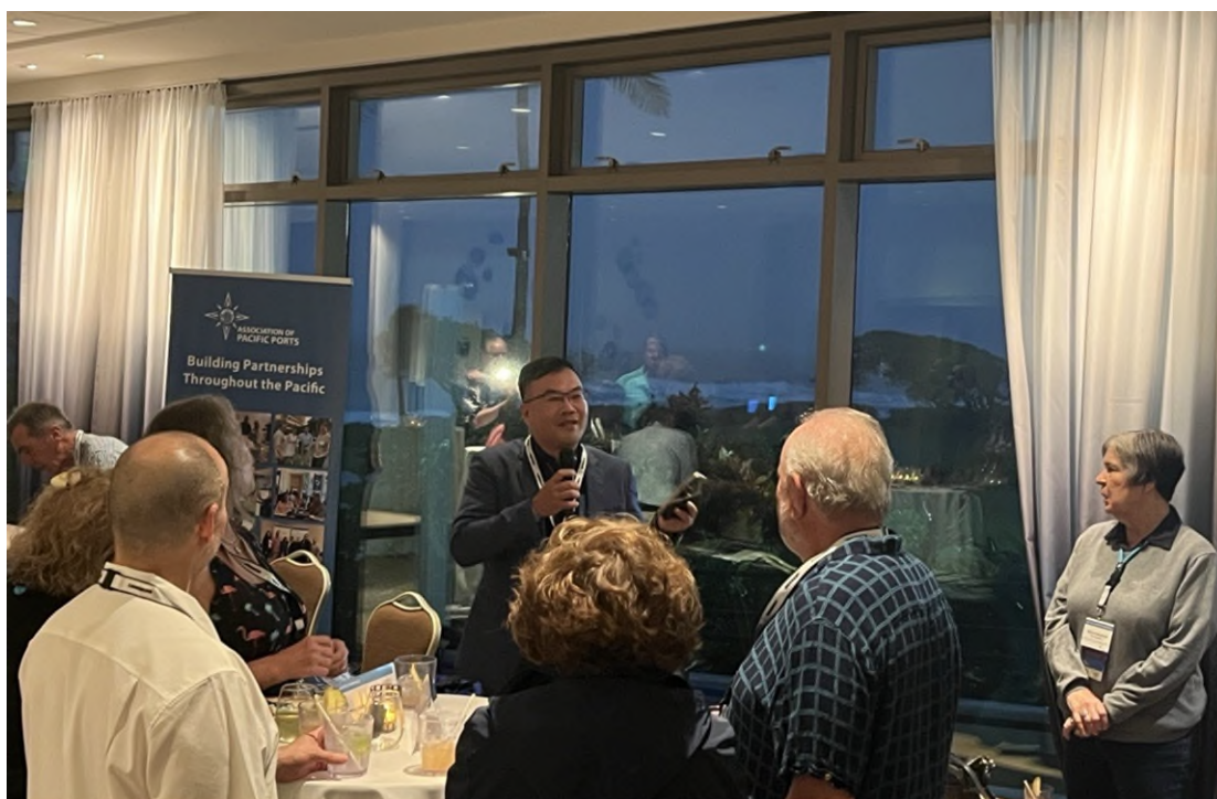
圖 1- 於會期第一天之晚會發表歡迎詞

前一屆(109 年)會期係由美西長堤港擔任主席，接續由港務公司接棒 110 屆主席，並預計 2024 年 8 月於高雄港以港埠轉型布局與永續發展規劃為議題主軸舉辦年會，邀請太平洋港口及相關產業翹楚齊聚高雄港，爰港務公司此次前往參加太平洋港口協會冬季年會除履行會務外，亦獲邀宣傳今年 8 月於高雄舉辦之 110 屆年會。(圖 1)