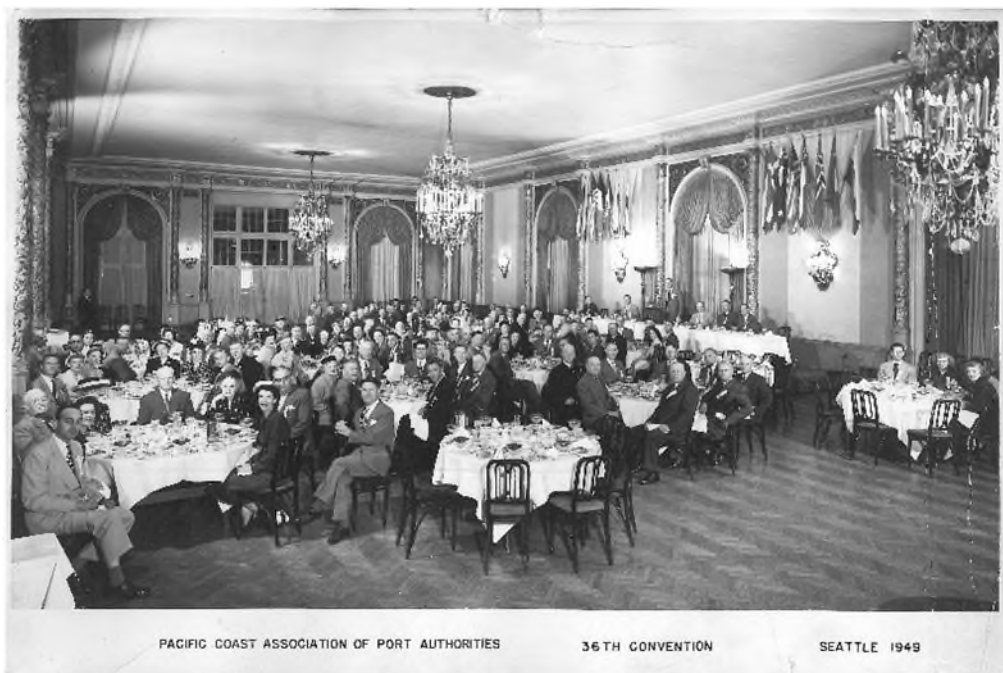
圖 2-1949 年第 36 屆年會(APP 前身 PACAP)於西雅圖舉行

自 2023 年 8 月起至 2024 年 8 月為太平洋港口協會第 110 屆會期，由港務公司總經理擔任執行委員會主席，綜理任期內之會務及主辦夏季年會事宜，爰本次獲邀出席冬季年會，並由業務處黃資深處長一民率隊前往夏威夷參與年會，宣傳及籌備 2024 年第 110 屆年會並執行會務。(圖 2、3)