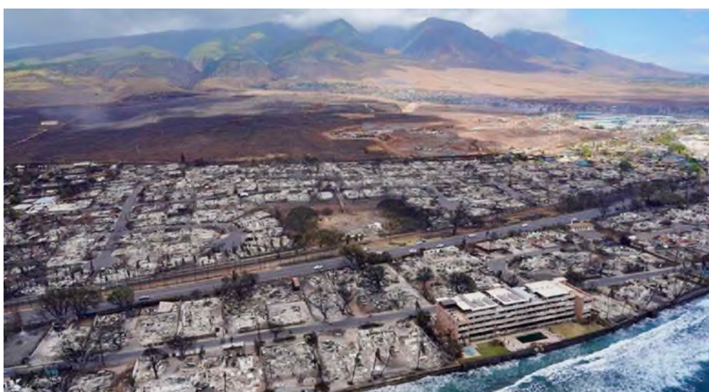
圖 5-2023 年 8 月夏威夷毛伊島火災災情

夏威夷第二大島毛伊島 (Maui) 於 2023 年 8 月爆發嚴重野火災情，2,200 棟建築物被摧毀，住宅區毀壞率高達 96%，近 100 人喪命，Pasha Hawaii(是擁有七十六年歷史的第三代家族企業 The Pasha Group 旗下的子公司)，為救災立即發起應變計畫、募集救災資源，更捐贈貨櫃改裝成臨時住所或教室以支持當地居民。此外，並與夏威夷港口當局及 Matson Line 共同合作調度港埠及營運資源，協助救災。(圖 5-8)