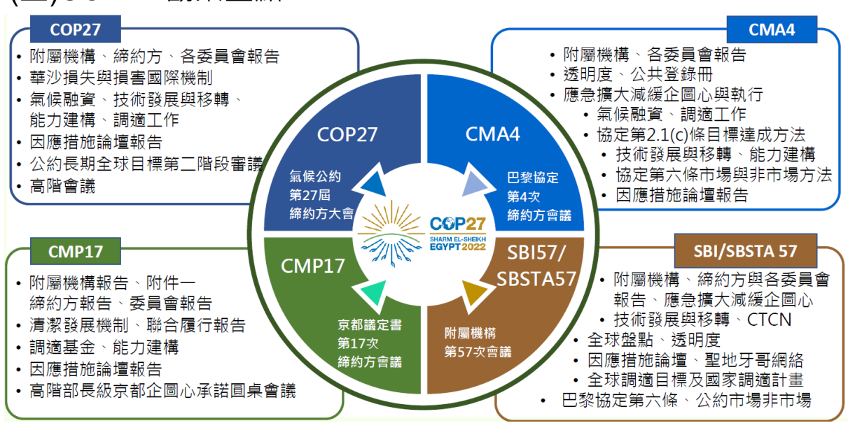
圖 2 COP27 大會重點議程

此次會議的核心課題主要為減緩工作方案(Mitigation Work Programme)、全球調適目標(Global Goal on Adaptation) 及損失與損害財務機制(Loss & Damage Finance)。減碳是根源,全球調適是願景,而損失與損害則成為前述兩大問題能否解決的關鍵核心。三大問題互為因果,各國面臨的已不再是單純的國內減碳問題,而必須同時就其他兩大面向之發展所帶來的衝擊有所因應。