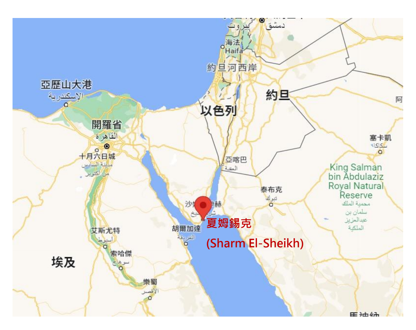
圖 1 夏姆錫克地理位置