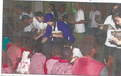
The youth ambassadors share gifts to every student.

The visiting Taiwanese youths since their arrival over the weekend have conducted a number of performance in Honiara as part of their cultural exchange program.