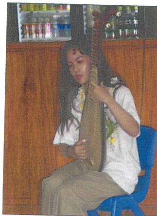
One of the youths displays her musical talent.