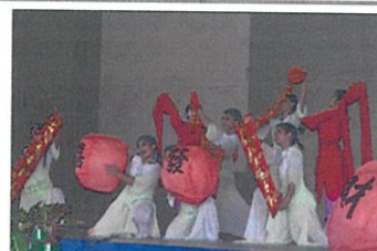
Another performance by 2019 Taiwan youth ambassadors.