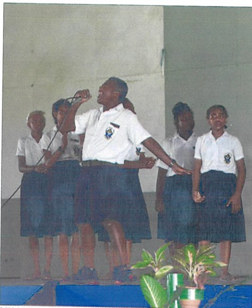
St Nicholas College students belt out tunes to a song at the program.