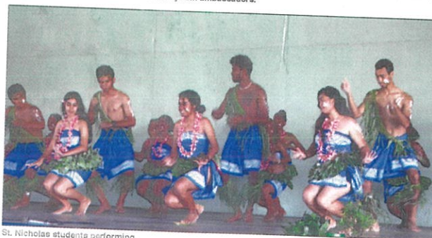
St. Nicholas students performing.

12 Solomon Star, Tuesday 3 September, 2019