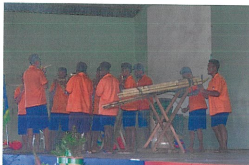
St Joseph's Tenaru brings panpipe music to the show.