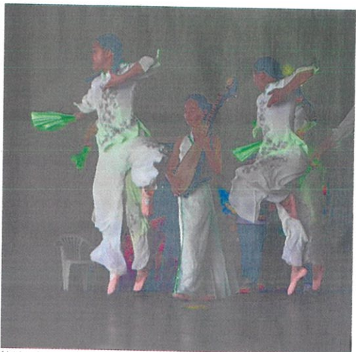
A lovely performance by female youth ambassadors.