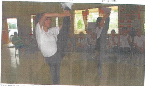
The martial art on display by two youths.