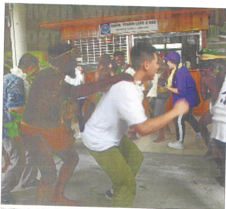
The visiting youths with SINU students involved in a Warriors dancer at the end of the program yesterday.