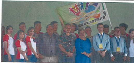
Officials with members of the 2019 Taiwan Youth Ambassadors.