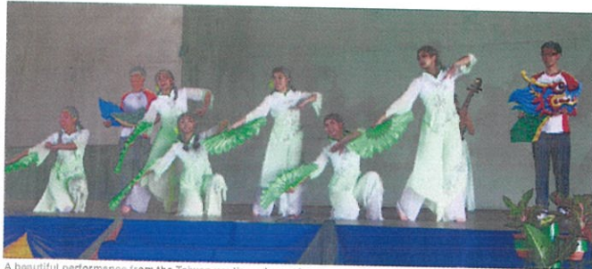
A beautiful performance from the Taiwan youth ambassadors.