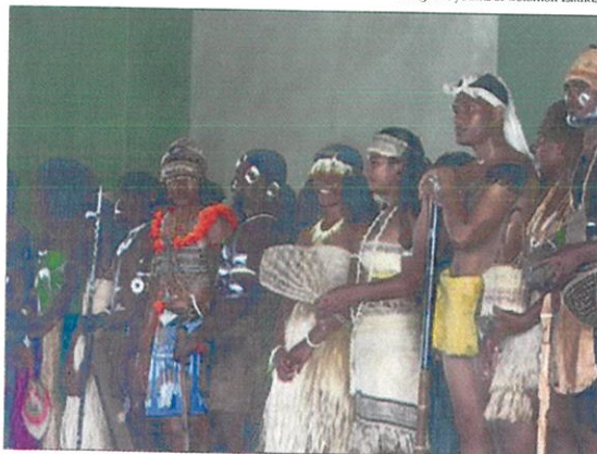
Betikuma Adventist College showcasing the culture of different provinces through traditional wear.