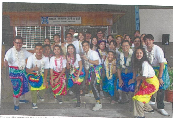
The youths wearing their gifts (Lavalava) presented by SINU students.