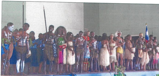
Students from Betikama Adventist College showcasing traditional costumes from all the provinces in Solomon Islands.