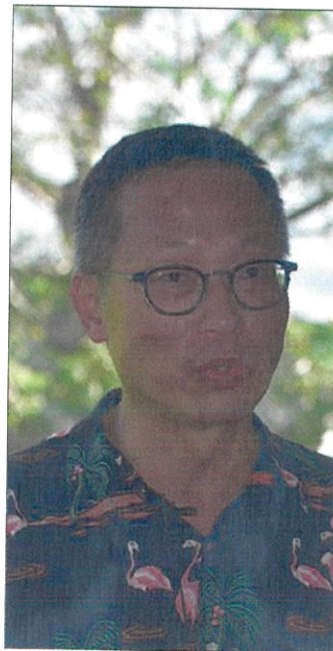
Republic of China (ROC), Taiwan Ambassador, Oliver Liao.

Liao said the cultural exchange brings the youths of Solomon Islands