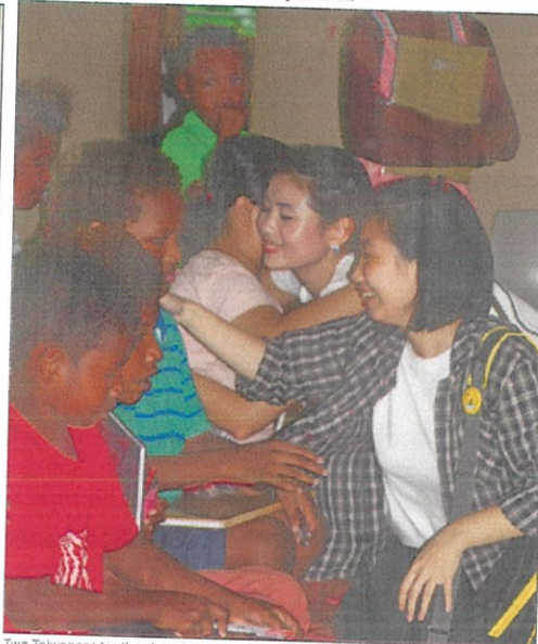
Two Taiwanese youths share last moments before farewelling the students.