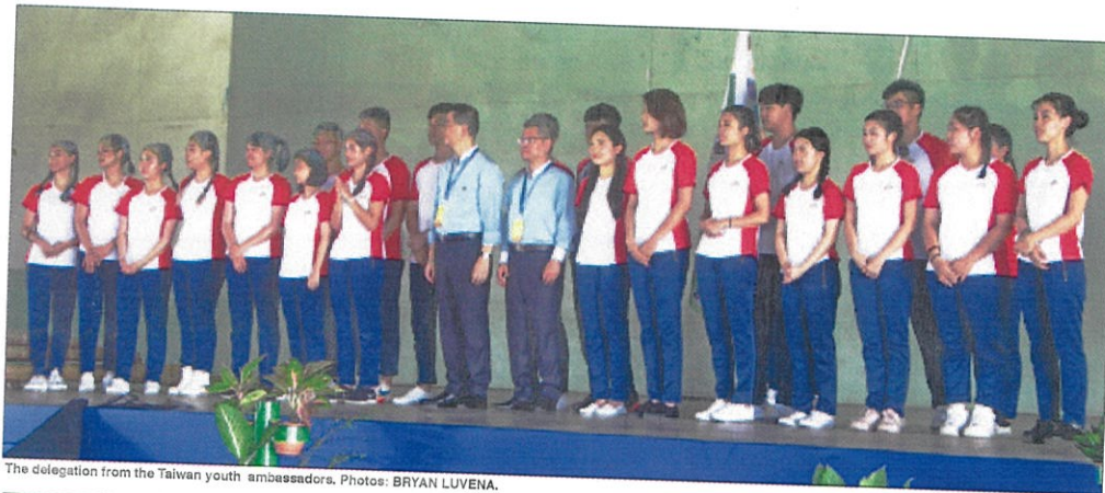
The delegation from the Taiwan youth ambassadors.