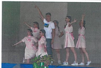
Taiwan youth ambassadors after performing a dance.