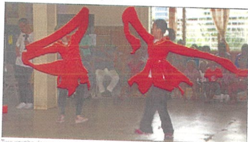
Two youths demonstrate their art culture.