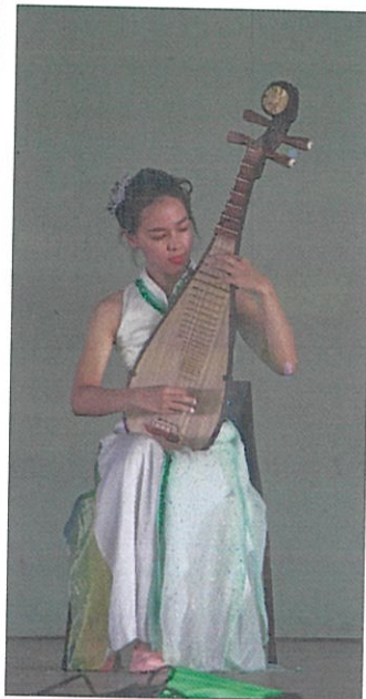
A young Taiwanese Ambassador playing a traditional Taiwanese instrument.