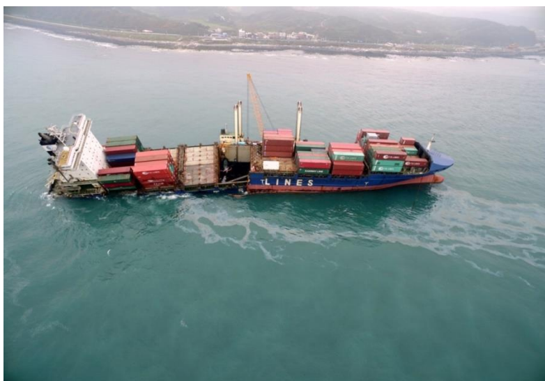
(德翔臺北貨櫃輪擱淺照片 2016 年 3 月 26 日)

德翔臺北貨櫃輪於 105 年 3 月 10 日因機械故障及海象惡劣擱淺，船上載有 407 噸重油及 40 噸柴油部分洩漏，這是我國首件貨櫃輪擱淺事件，3 月 24 日受強烈東北風影響船體斷裂，船上殘油與貨品大量外洩並造成新北市石門附近 26.3 公里岸際及海上之油污染；行政院環境保護署成立跨部會「重大海洋油污染緊急應變中心」統籌協調調度應變事宜。