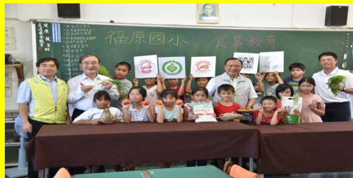
School lunch using “4 labels 1 Q” materials