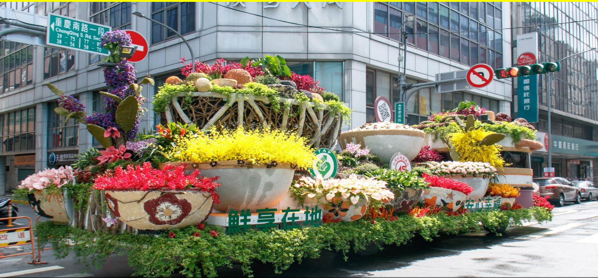
Flower float in the National Day which promoted “4 Labels 1 Q” and “Local Production, Local Consumption”