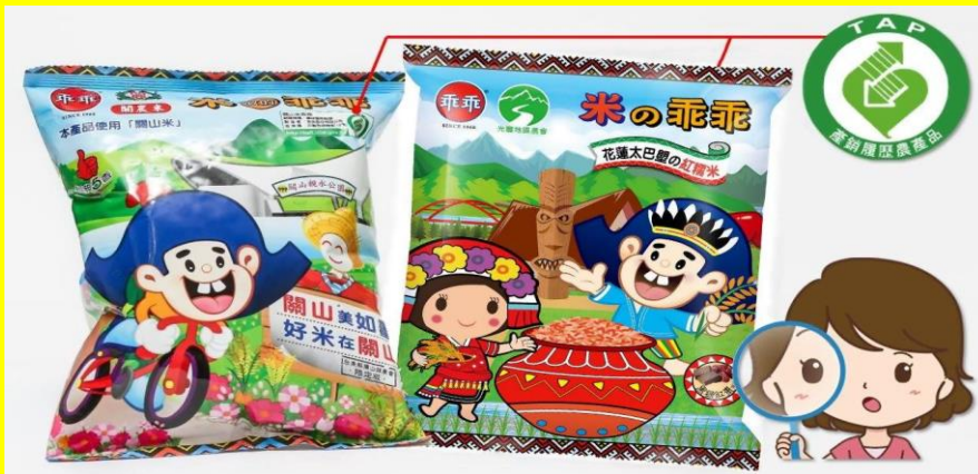
Rice products made of certified traceable ingredients