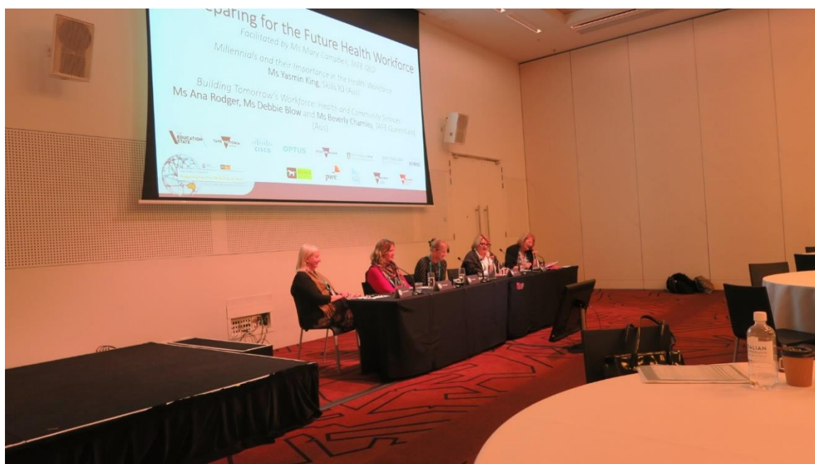
澳洲 DET 計畫主持人/SkillsIQ 執行長 King 報告未來健康照護勞動力