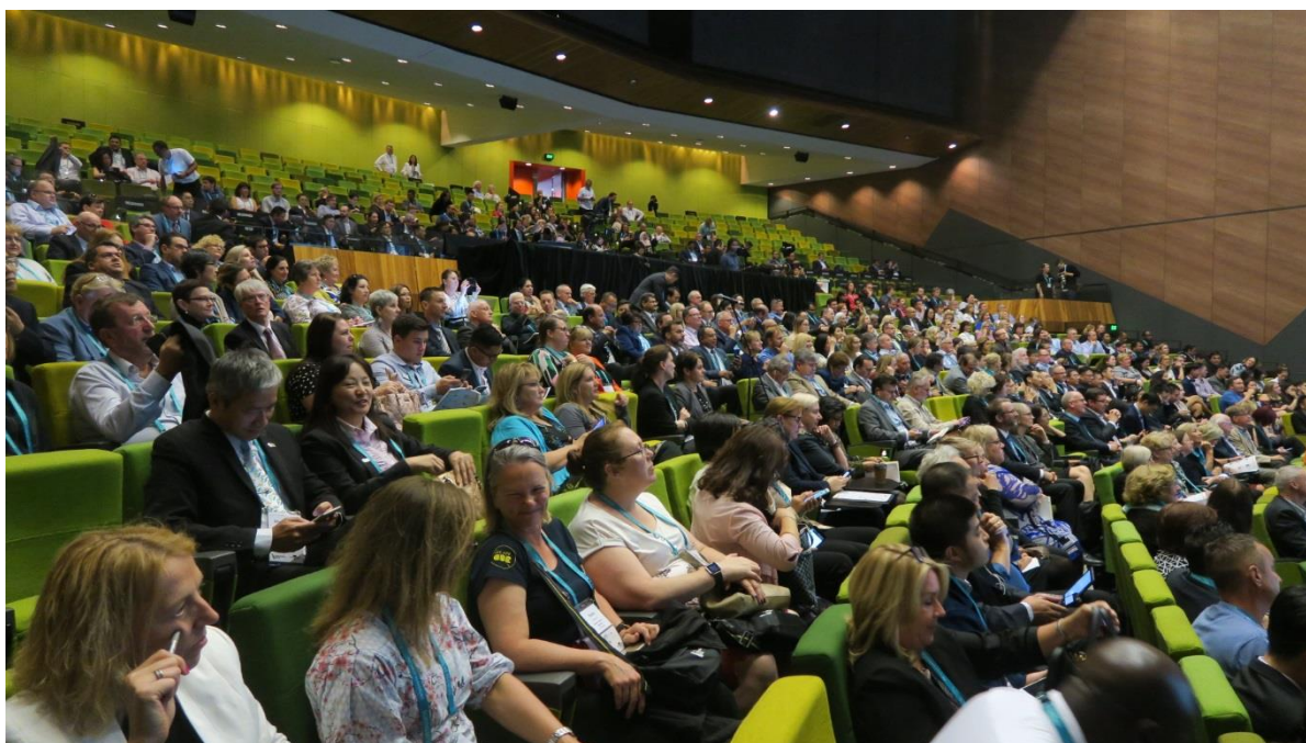
WFCP 世界大會盛大開幕超過 800 名職訓產官學訓機構領袖與會