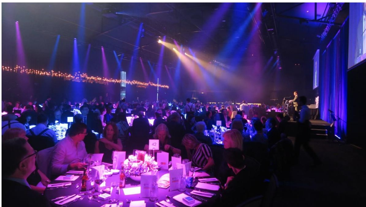
受邀出席 WFCP 技職「傑出成就獎」頒獎典禮