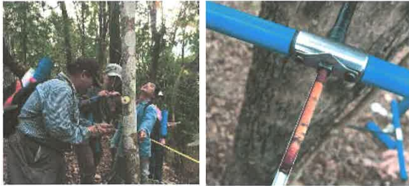
Photo 17. Tree selection and wood samples collection