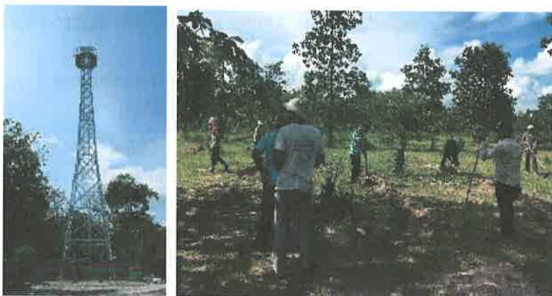
Photo 1. Forest fire monitoring tower established in Tamao zoo in Takeo Province, Cambodia (L); Participatory forest restoration in local community (R)