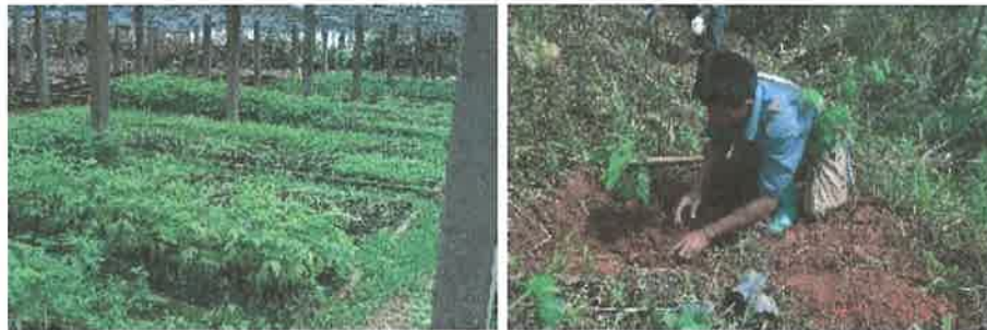
Photo 12. Supporting to establish village nursery and forest restoration program in northern Laos