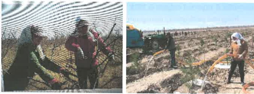
Photo 6. Farmers tending wild apricot (L); Establishing 30 hm 2 forest stands of Mongolian pine mixed with Xinjiang poplar (R)