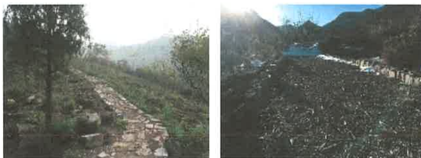
Photo 14. Forest trails constructed in the project area of Shichangyu village