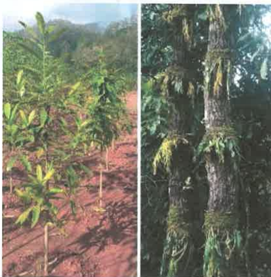
Photo 3 Establishment of botanic garden (left); the understory plantation of Dendrobium (right)