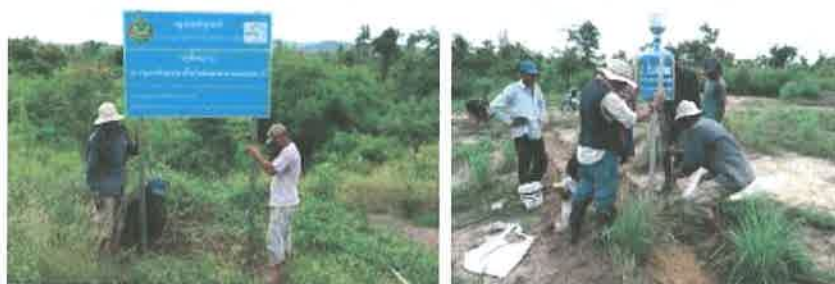
Photo 13. Agroforestry plot established (L); Hydrological monitoring systems set up (L)