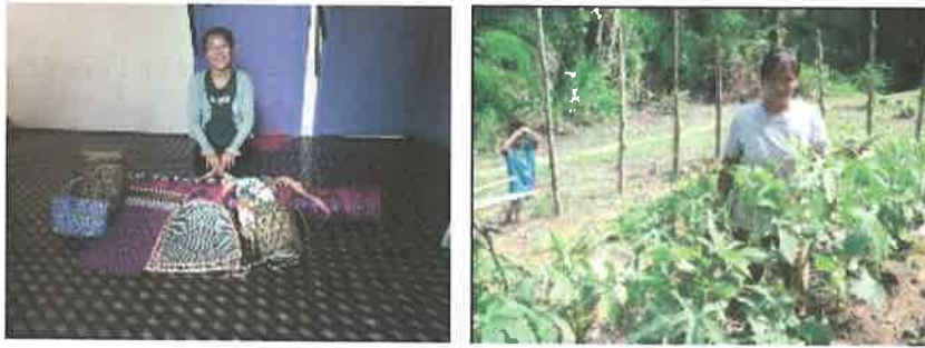
Photo 16. Livelihood much improved in the target communities