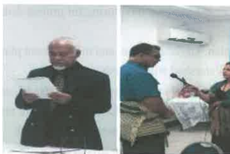
Photo 11 Hon. Semisi Taelangi Fakahau, Minister of Forests, addressing to launch the Sandalwood Regulations (L), media coverage of the Sandalwood Regulations (R)