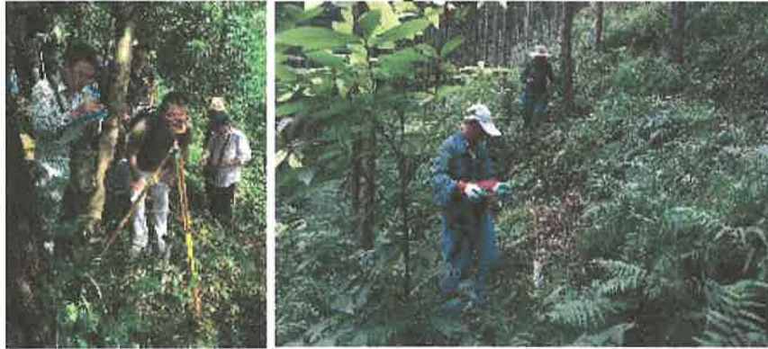
Photo 7. Forest resources inventory in Qing Yang county