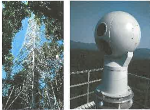
Photo 2. Forest fire monitoring tower in Luang Namtha, Laos (L); the Forest watcher (R)