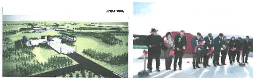
Photo 8. 3D visualization of the botanic park (L); A ribbon-cutting ceremony in October, 2016 (R)