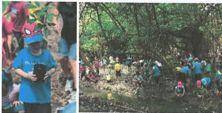
Photo 10. Local school children planting trees in promo event