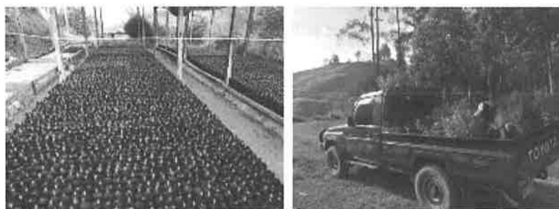
Photo 4. Nursery built up and seedlings distributed to villagers