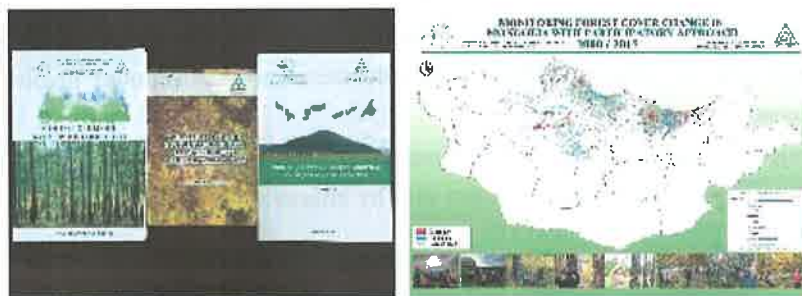
Photo 9. Books published (L); Map of forest cover change 2000-2015 for Mongolian (R)