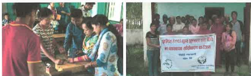
Photo 11. Wooden handicraft training for community women in Makawanpur, Nepal (L); Mini-NTFP enterprises established in Sarlahi, Nepal (R)