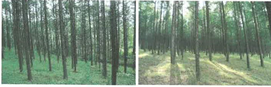
Photo 19. Intermediate cuttings conducted to allow space for valuable timber trees Activities & expected outputs in 2018