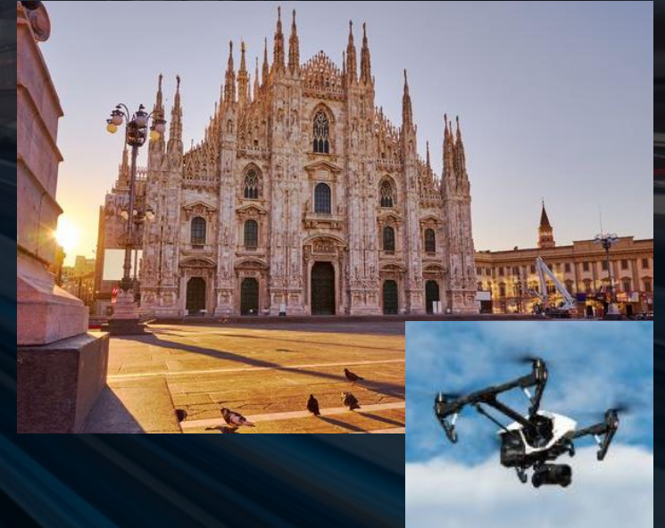
Safety & Surveillance Drones for aerial security