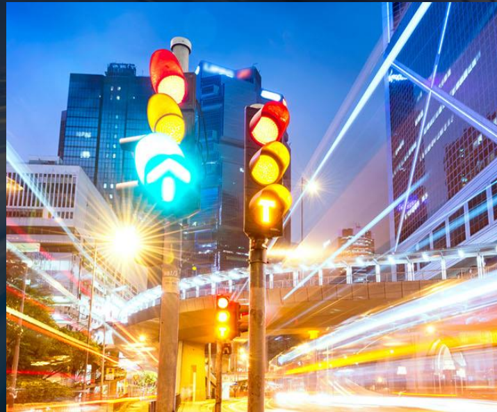
Automotive & Mobility Cooperative urban cross traffic