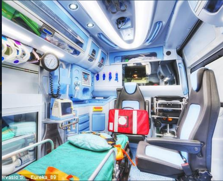
Health & Wellbeing Connected ambulance