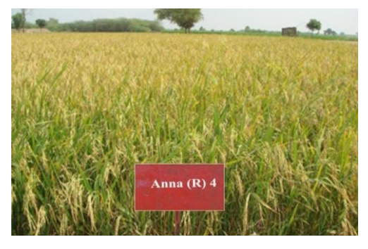
Anna 4, drought tolerant rice