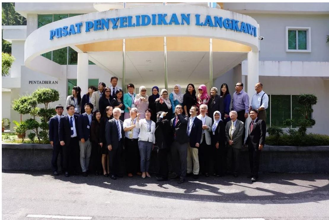
與會人員於 UKM 蘭卡威研究中心(會場)合影留念。