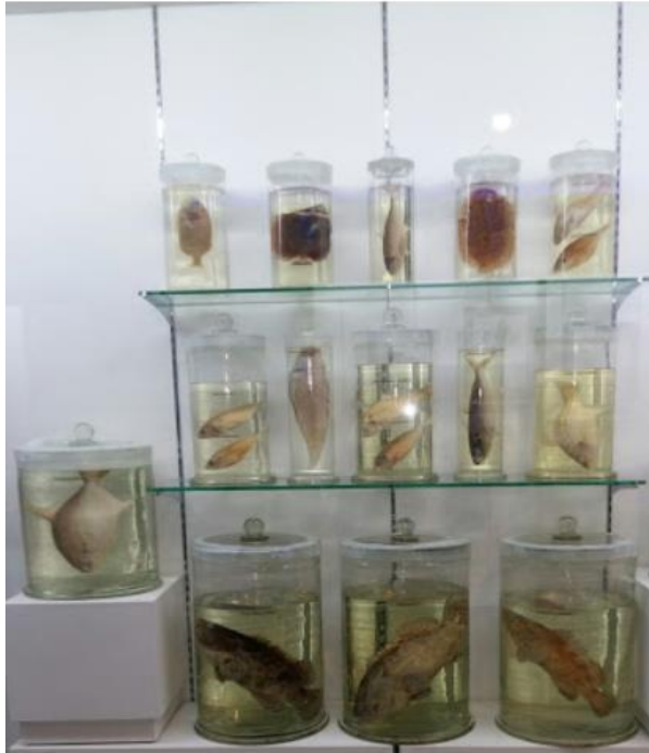
Universiti Kebangsaan Malaysia蘭卡威研究中心的當地生物標本