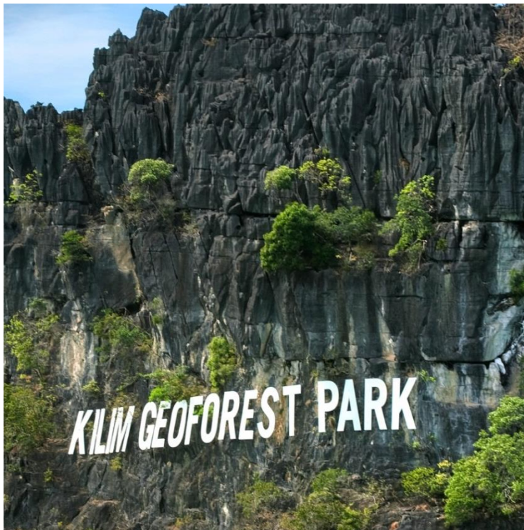
位於Universiti Kebangsaan Malaysia蘭卡威研究中心附近之生態公園Kilim Geoforest Park