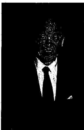
Professor LIU Mingkang Former Chairman, China Banking Regulatory Commission BCT Distinguished Research Fellow, Lau Chor Tak Institute of Global Economics and Finance, The Chinese University of Hong Kong

Professor Liu Mingkang served as the first Chairman of the China Banking Regulatory Commission (CBRC) between March 2003 and October 2011, and was a member of the 17th Central Committee of the Communist Party of China. He is currently Vice-Chairman of the Committee for Economic Affairs of the Chinese People's Political Consultative Conference.