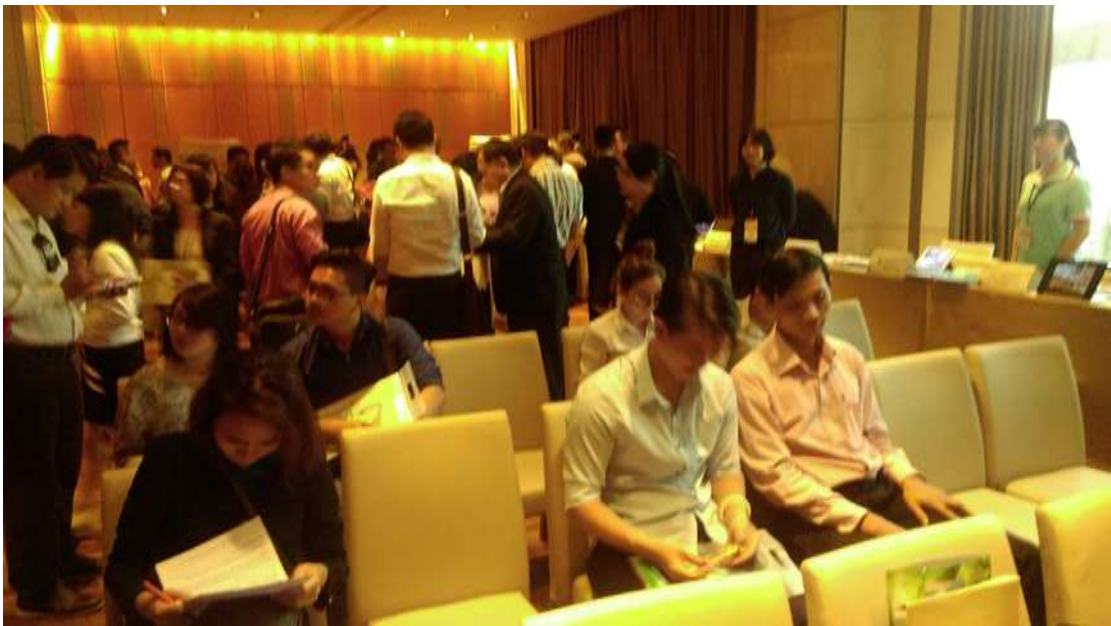
與越南當地旅行業者交流