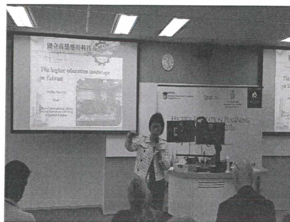
活動說明：戴貞德國際長報告 The higher education landscape in Taiwan