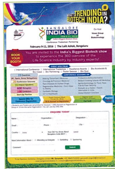
Landing Page for the Campaign

e-Visitor Registration Campaign fetched 426 e-Visitors registered to visit Bangalore India Bio 2016 Exhibition.