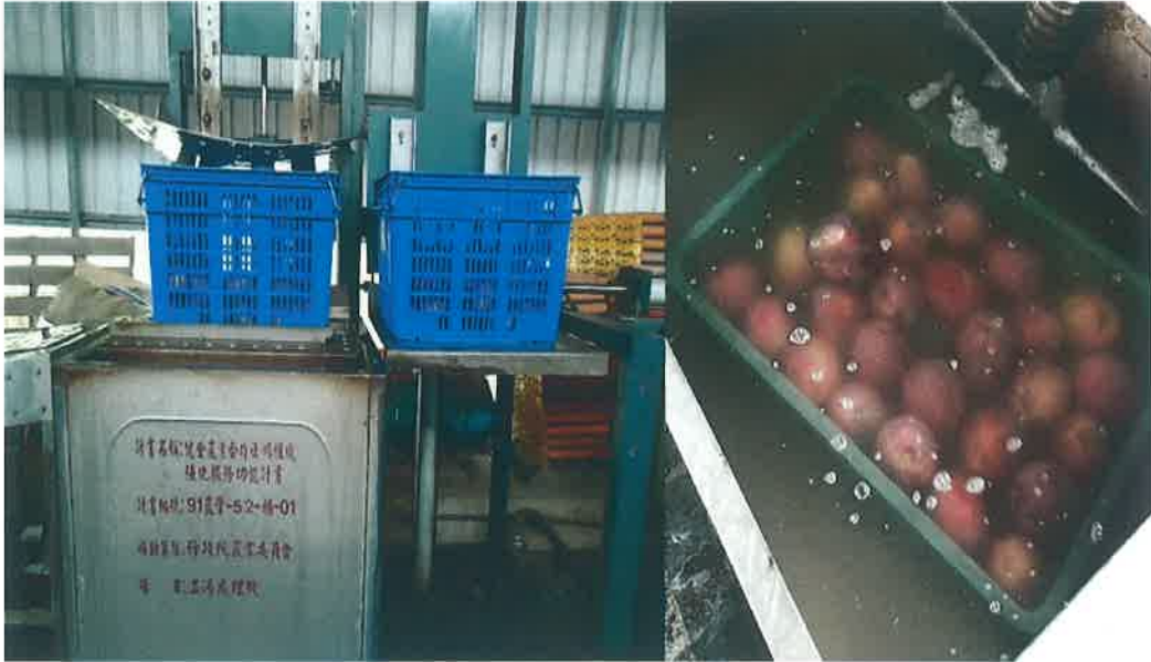
Figure 3. Hot water treatment is constrain latent diseases and extend shelf life

In addition to reducing the temperature in the packaging field equipped with air conditioning, water selection and wash based on weight are carried out to remove dust and spots. Later, hot water treatment is implemented to constrain latent diseases from developing and extend the fruit's shelf life.