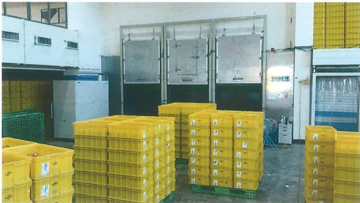
Figure 4 . After the steaming handling and temperature reduction

Mangoes for export to Japan and Korea require quarantine treatment to ensure that insects are killed completely. After the steaming handling and temperature reduction, the packaging operation is carried out. Starting in 2007, every mango in the packaging process is labeled with the name of each farmer for traceability.