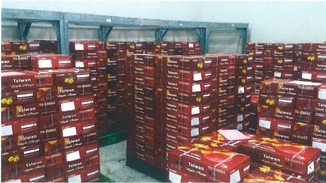
Figure 5 . Mangoes for export are stored in refrigerators after packaging

Mangoes for export are stored in refrigerators after packaging and are shipped in refrigerated containers. After grading, sorting, and packaging are complete, the Farmers' Associations hire trucks to ship mangoes for domestic and wholesale markets.