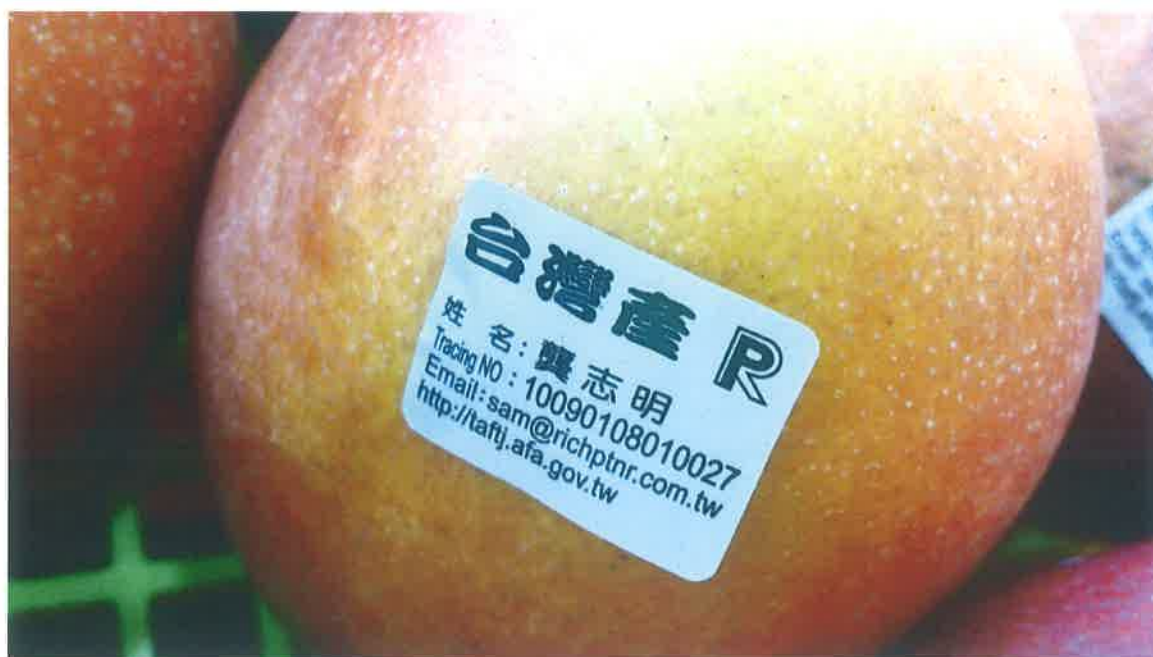
Figure 2. Each mango is labeled with traceability barcode

To ensure food safety meeting production specifications of exporting countries, each mango is labeled with a traceability barcode. Inspection of pesticide residues is held before harvest, and farmers may only harvest mango after passing inspection. In addition, mangoes for export to Japan are additionally inspected in the steaming house. Once they are passed, documents for approval of export to Japan are issued for exporters to proceed.