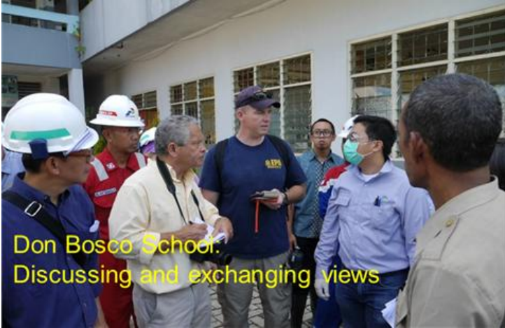
Don Bosco School. Discussing and exchanging views