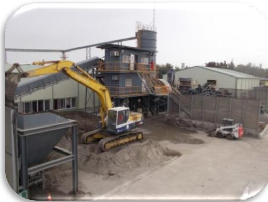
Wet (Separation ) Treatment