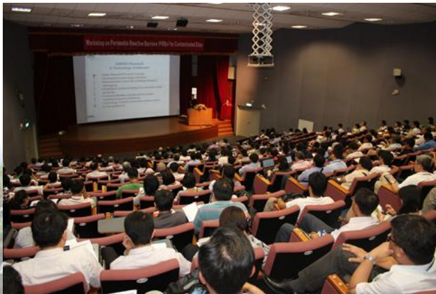
Annual Training Workshop

Share knowledge and experience among Taiwan, USA and other countries through meetings, field investigations, and remote conferences.