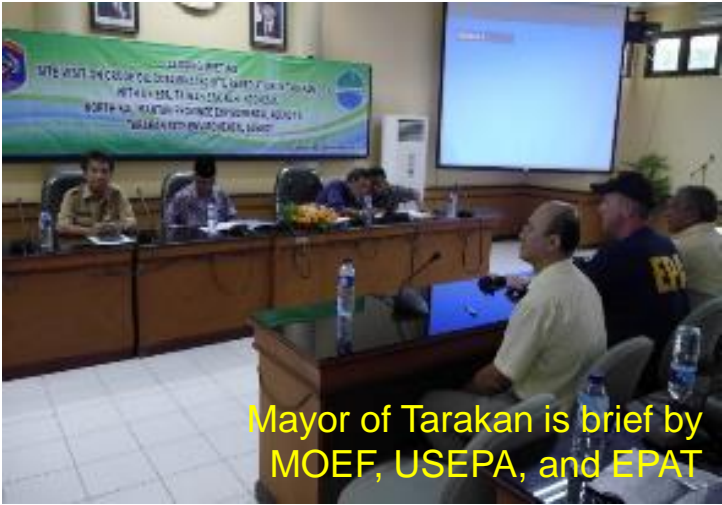
Mayor of Tarakan is brief by MOEF, USEPA, and EPAT