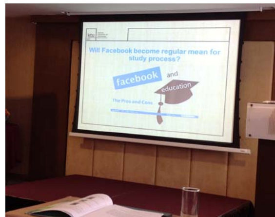
Social Media 社群媒體與教育