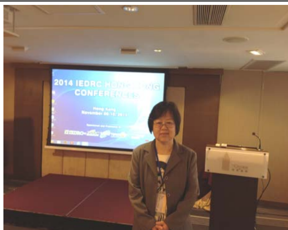
攝於香港 城景國際酒店 鑽石廳 Room B (第 5 場發表)