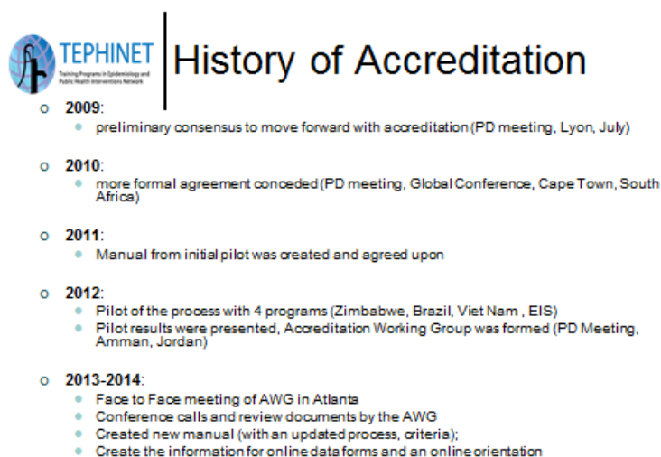
圖三、TEPHINET 推展 FETP 評鑑與認證規劃歷程

鼓勵會員申請參加評鑑與認證，同時也希望在未來的 5—6 年內，能將 FETP 評鑑與認證納入常規標準，至於評鑑所需的經費，則由申請者負擔。