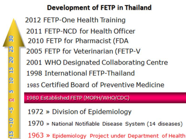
圖二、泰國 FETP 發展歷程

約旦：約旦的 FETP 是參考美國 CDC 的 Epidemic Intelligence Service (EIS) 2 年的訓練計畫，此計畫的任務是增加國家公共衛生人力的流行病學專業量能，目前有 54 位畢業生，皆為醫師，60% 的畢業學員於中央政府機構任職，目標也是希望達到 IHR 要求，每二十萬人口有一位受過訓的現場流行病學家。長期訓練的學員在派駐於衛生部的期間，能為衛生部暫時紓解人力緊迫的需求，而高素質且受過良好訓練的畢業生則能為衛生部提供高階技能的專家。FETP 參與的活動包含傳染性疾病和非傳染性病之監測、群聚事件調查、敘利亞難民危機處理、