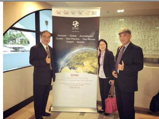
EQUIS 是 EFMD 旗下認證之一