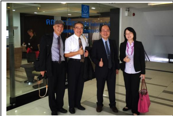
泰國 Thammasat 商學院主辦