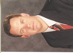
JON BRUNING ATTORNEY GENERAL STATE OF NEBRASKA