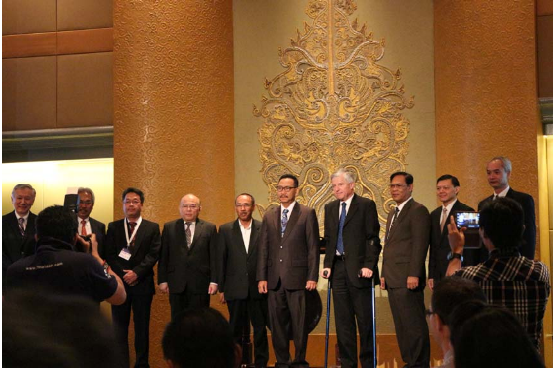
所有 Special Speaker 上台合影