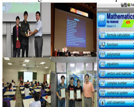
Pic. 5: Students win prizes at the Popular Science Mini-Dissertation contest under instruction of teachers.

mation. In the future, the project achievement will be reported as experience sharing for curriculum development.