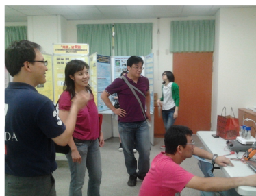
Pic 4: Team instructors visit National Miao-Li Agricultural and Industrial Vocational High School for exchange.

Additionally, we also visited the first-phase High Scope project team for National Miao-Li Agricultural and Industrial Vocational High School (MLAIVS) to observe the experimental model and evaluate its results (as shown in Pic. 4), thereby fully gaining promotional results. This was significantly beneficial to the development of the instructors' curriculum and course or curriculum evaluation.