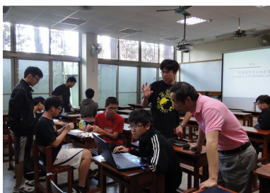
Pic. 2: University evaluation team engages in classroom observation.

with the four curriculum development instructors, and interaction and discussion between the evaluation team and instructors, it became apparent that the instructors' professional literacy regarding emerging technology instruction had grown. Furthermore, through semi-structured interviews with students who had participated in the project's special topic courses, the reliability and validity of the quantitative questionnaire were supplemented.