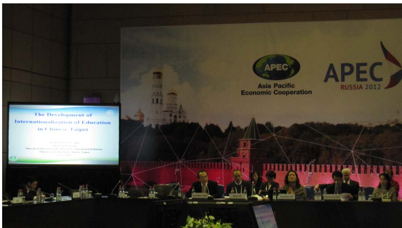
林文通處長在 APEC 會場發表專題報告