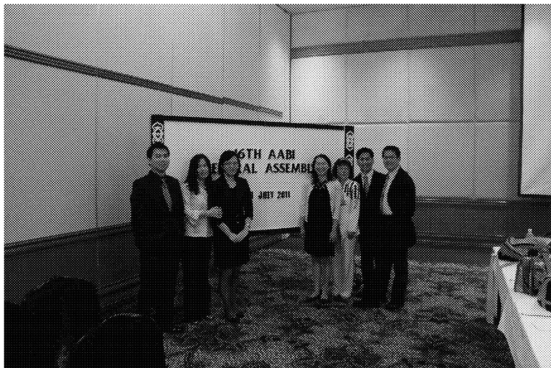
第 16 屆 AABI 年會與會代表合影