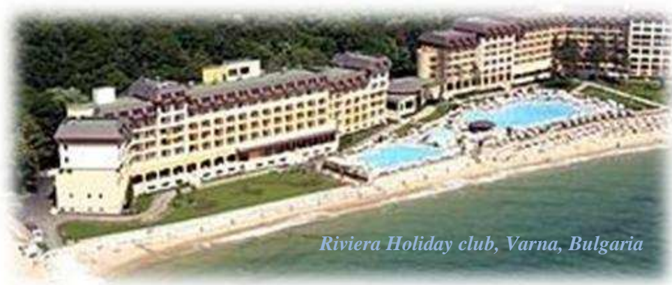
Riviera Holiday club, Varna, Bulgaria

Organized by: Women in Nuclear-Global & Women in Nuclear-Bulgaria