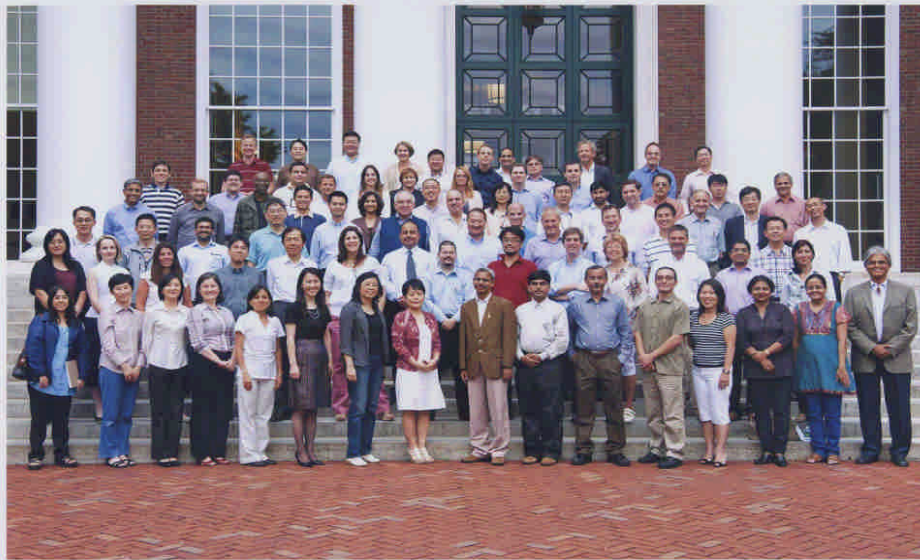
Global Colloquium on Participant-Centered Learning July 24 - 30, 2011 Harvard Business School