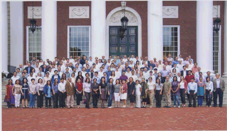
Global Colloquium on Participant-Centered Learning July 24 - 30, 2011 Harvard Business School