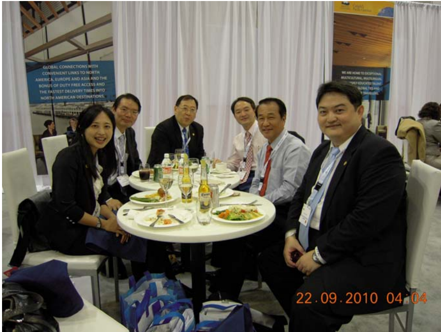
Networking Lunch 由柏林機場作東

晚上於會議中心舉辦晚會，由下屆主辦單位德國柏林機場贊助，柏林機場並於會中積極行銷下一屆會議的優惠方案。