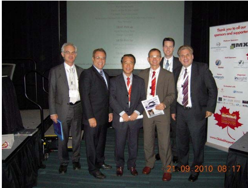
李副局長與 Session 4 會議主持人及所有與談人合影