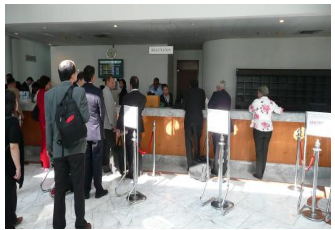
圖 1、MP22 會議地點 United Nations Conference Centre