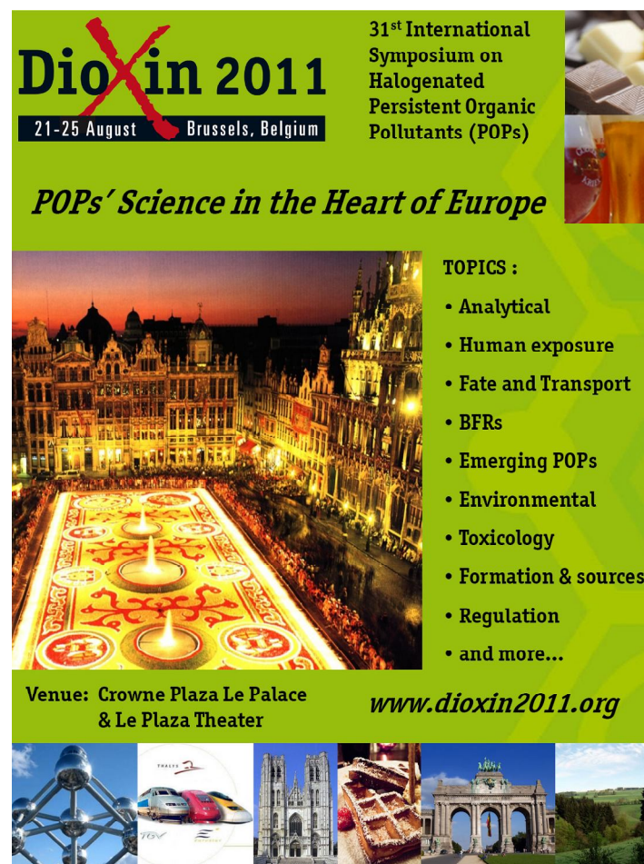
圖 7、2011 年第 31 屆國際鹵化持久性有機污染物研討會宣傳海報

續參與此活動，相關網址為 http://www.dioxin2011.org/ 。