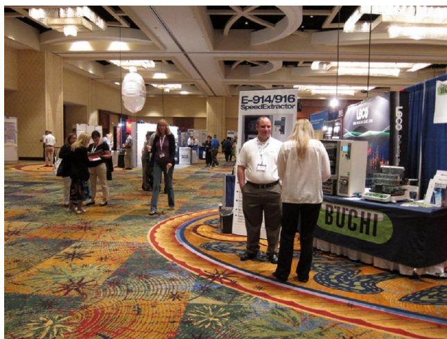
圖 6、國際持久性有機污染物戴奧辛研討會： 論文海報展示場地、儀器展示場地