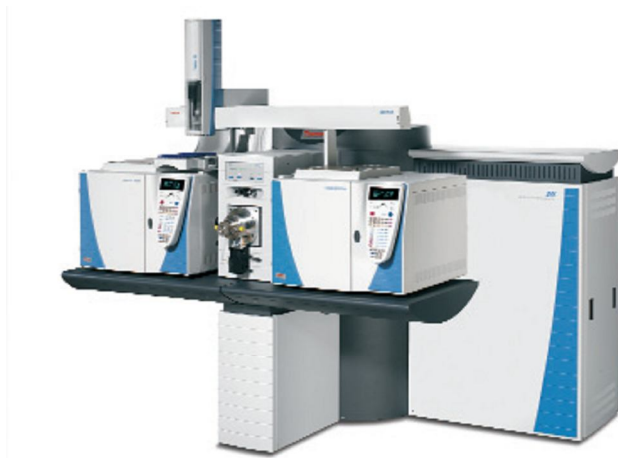
圖 2、DFS - HRGC/HRMS

DFS - HRGC/HRMS為Thermo公司推出的檢測戴奧辛與呔喃的機器。它包括TRACE GC Ultra? gas chromatograph、TriPlus? Autosampler、mass spectrometer部份。可檢測相當低的濃度 ( \ll 100 fg)、敏感度亦很高 (S/N=200 : 1)。