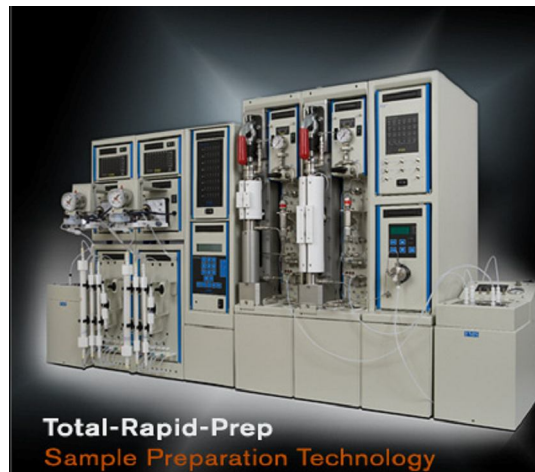
圖 1、Total-Rapid-Prep 儀器

本研討會為為戴奧辛等前處理設備廠商（Fluid Management Systems，FMS）與分析儀器廠商（Thermo Scientific）聯合舉辦之技術研討會。