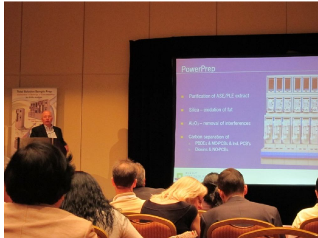
圖3、Total Solution for POP Analysis研討會相關照片