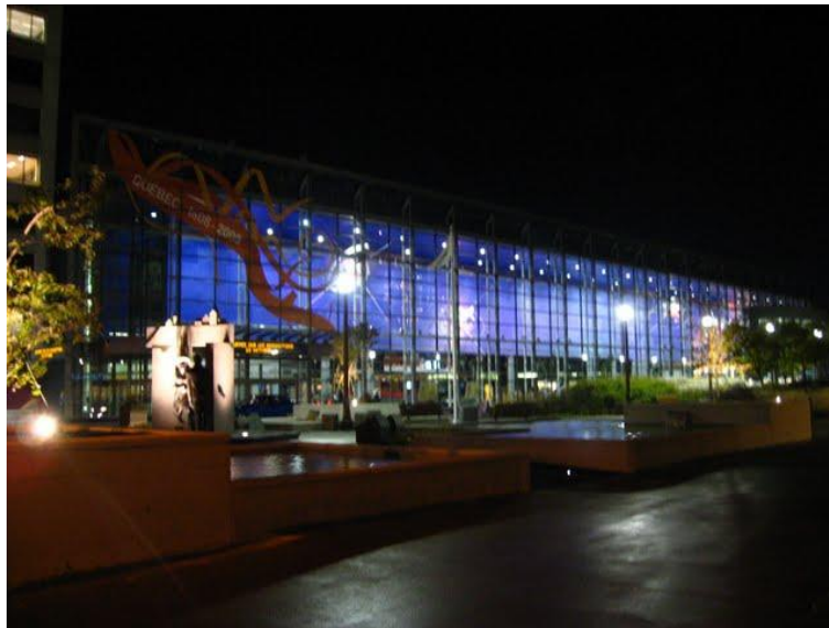
2008 10th World Leisure Congress 在 Quebec City 的 International Convention Center 舉辦

世界休閒學術研討會(World Leisure Congress)為每兩年舉辦乙次之世界性學術研討會。該研討會為休閒遊憩相關領域最重要之學術研討會之一，因此吸引來自世界各地相關從業人員參與投稿及與會，並藉由參加會議得以了解世界各國對休閒遊憩之政策與推行，以及相互觀摩各地學者針對相關議題之研究方向，對所任職之系所日後之研究及發展方向更能國際化且更容易與世界趨勢接軌。此次的休閒大會假世界遺產重要城市 Quebec, Canada 舉辦，除了學術的交流外，更有文化介紹的重要意義。