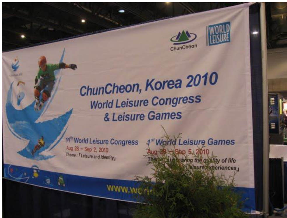
下次 2010 WLRA 在韓國濟州 也就是冬季戀歌的所在地

下一屆的 WLRA 將由韓國舉辦，除了學術研討年會之外，另外也準備了第一屆 Leisure Game，正式鼓勵休閒運動的競賽項目。韓國人積極的態度真是值得學習。