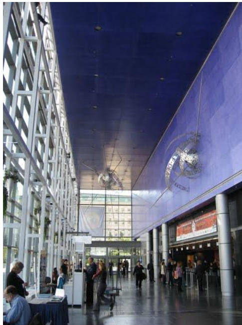
Convention Center 內景 應該跟我們的世貿很類似 很寬廣 設計很現代