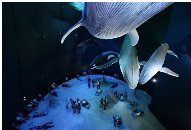
Among the whales