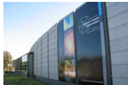
NMCC Campus in Rotherham, Vic

Beauty Point Campus: Programs in fisheries, marine resource management and small vessel operations are delivered at Beauty Point, about 50 km north of Launceston, near the mouth of the Tamar