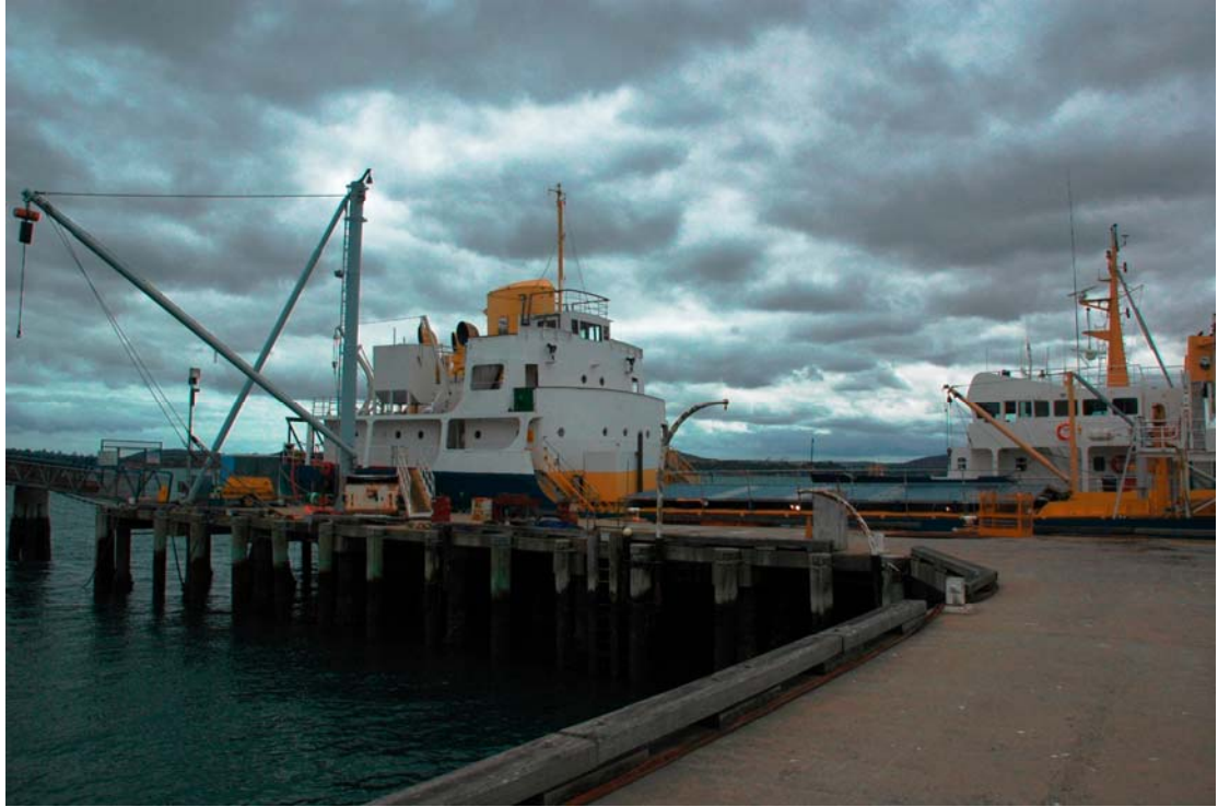
圖三 AMC 位於 Beauty point 的校區之實習船。