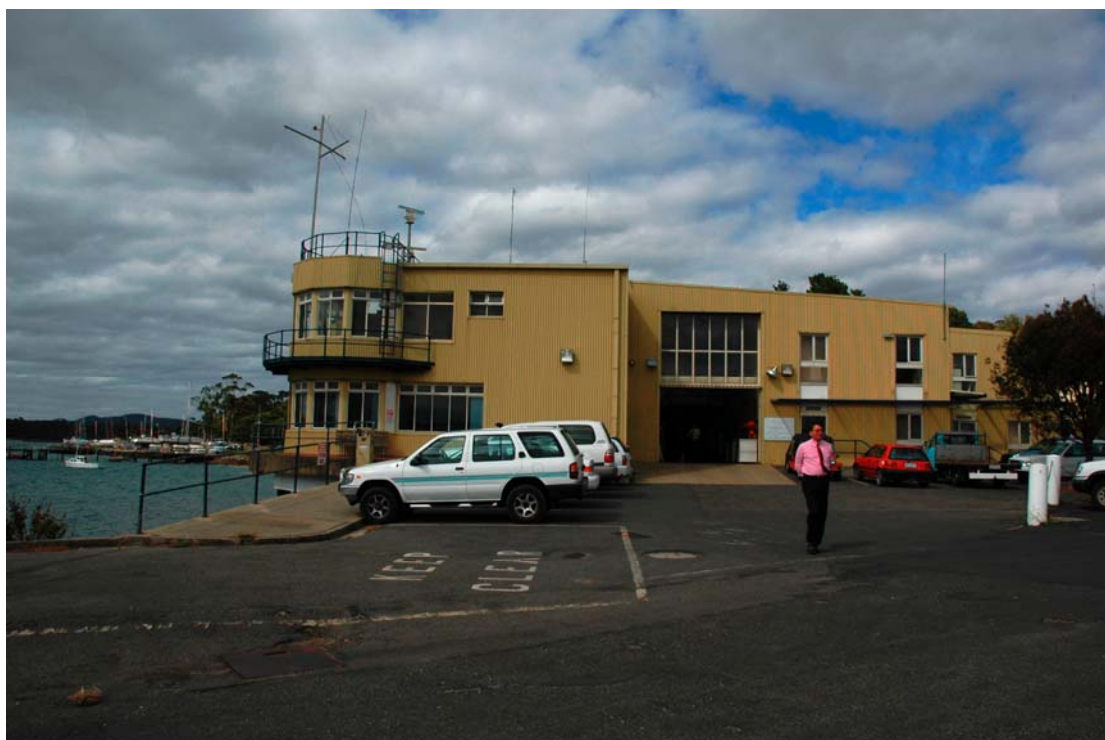
圖二 AMC 位於 Beauty point 的校區