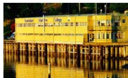
AMC Beauty Point Wharf Campus