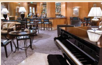
RELAX OR NETWORK IN THE UKESAD HOTEL RECEPTION AREA