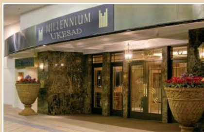
A FEW STEPS FROM GLOUCESTER ROAD TUBE STATION