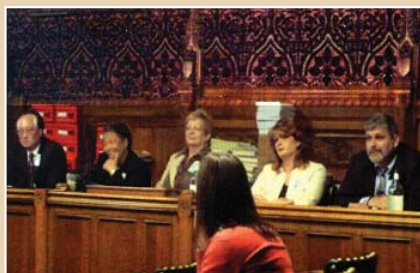
UKESAD DELEGATES AT THE HOUSES OF PARLIAMENT